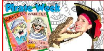
How to Draw a Pirate Portrait