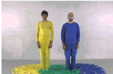
Primary Color Song