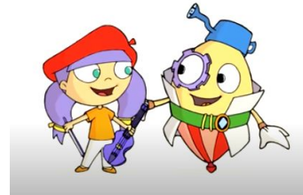
Mati & Dada Story about Leonardo Da Vinci