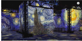
Vincent Van Gogh ALIVE Museum Tour

**Click on a PICTURE, and it will take you to an activity.