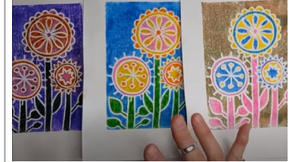
Simple Marker Prints You can draw & print whatever you want.