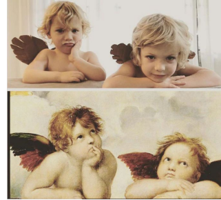
Reenact a work of Art