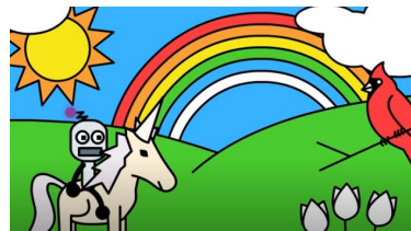
Scratch Garden Color Song